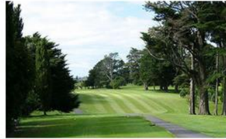
HOLE 1 - TEE

A short par 5 to start - for the longer hitters the right hand fairway bunkers can come into play, so 3 wood can be a good option just to get your round started. Driver for higher handicappers is sensible play, and anywhere on the left side of the fairway is ideal because trees on the right around the 135 meter marker can come into play. Greenside bunkers left and right.