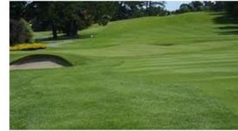
HOLE 1 - PUTTING GREEN